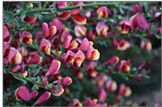
Burkwood's Broom flowers

Burkwood's Broom is recommended for the following landscape applications;