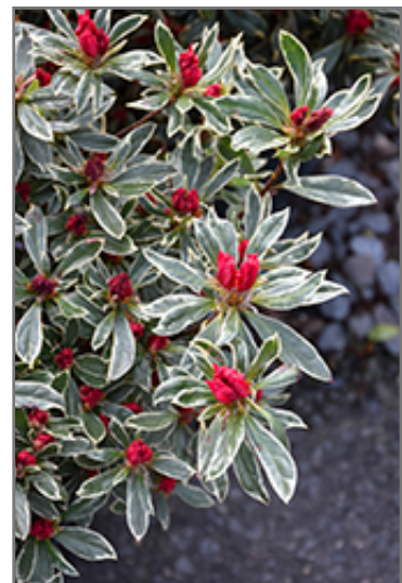
Silver Sword Azalea foliage