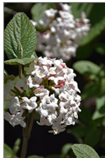
Diana Koreanspice Viburnum flowers