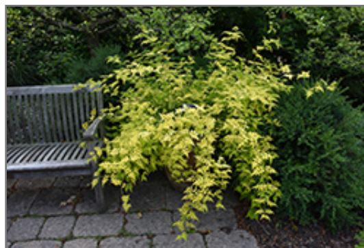
Fiona Sunrise Jasmine

This is a relatively low maintenance woody vine, and should only be pruned after flowering to avoid removing any of the current season's flowers. It is a good choice for attracting bees and butterflies to your yard, but is not particularly attractive to deer who tend to leave it alone in favor of tastier treats. It has no significant negative characteristics.