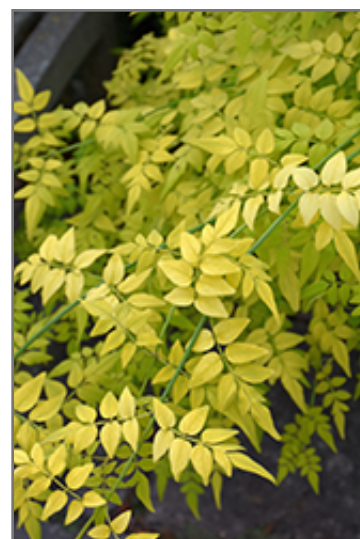
Fiona Sunrise Jasmine foliage