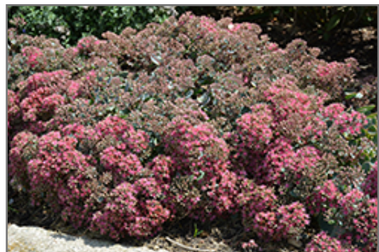
Popstar Stonecrop in bloom