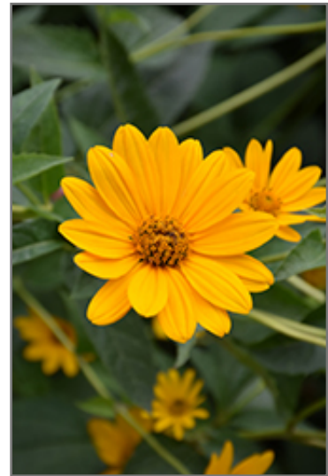
False Sunflower flowers

This is a relatively low maintenance plant, and is best cleaned up in early spring before it resumes active growth for the season. It is a good choice for attracting butterflies to your yard. It has no significant negative characteristics.