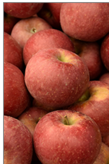
Winesap Apple fruit

This is a deciduous tree with a more or less rounded form. Its average texture blends into the landscape, but can be balanced by one or two finer or coarser trees or shrubs for an effective composition. This is a high maintenance plant that will require regular care and upkeep, and is best pruned in late winter once the threat of extreme cold has passed. Gardeners should be aware of the following characteristic(s) that may warrant special consideration;