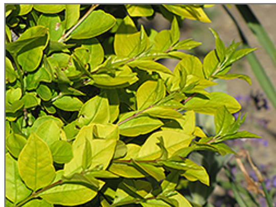
Golden Privet foliage