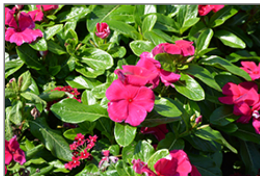
Cora Cascade Magenta Vinca flowers

Cora Cascade Magenta Vinca is recommended for the following landscape applications;