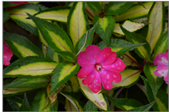
SunPatiens Compact Tropical Rose New Guinea Impatiens flowers