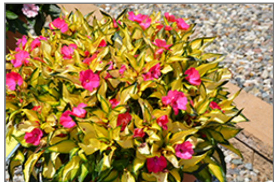
SunPatiens Compact Tropical Rose New Guinea Impatiens in bloom