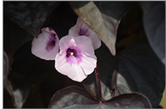
Sweet Caroline Sweetheart Jet Black Sweet Potato Vine flowers

Sweet Caroline Sweetheart Jet Black Sweet Potato Vine will grow to be about 12 inches tall at maturity, with a spread of 30 inches. Its foliage tends to remain dense right to the ground, not requiring facer plants in front. This fast-growing annual will normally live for one full growing season, needing replacement the following year.