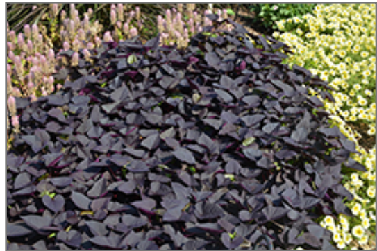
Sweet Caroline Sweetheart Jet Black Sweet Potato Vine

This is a relatively low maintenance plant. The flowers of this plant may actually detract from its ornamental features, so they can be removed as they appear. It has no significant negative characteristics.