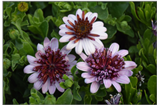
4D Berry White African Daisy flowers

4D Berry White African Daisy is recommended for the following landscape applications;