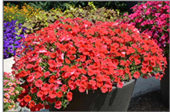
Supertunia Really Red Petunia in bloom