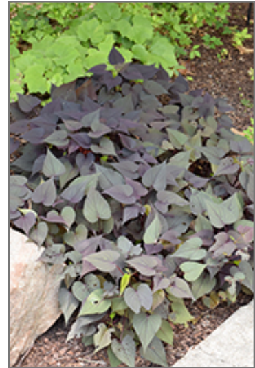
Sweet Georgia Heart Purple Sweet Potato Vine