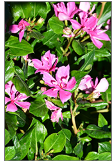
Soiree Kawaii Double Pink Vinca flowers

Soiree Kawaii Double Pink Vinca is recommended for the following landscape applications;