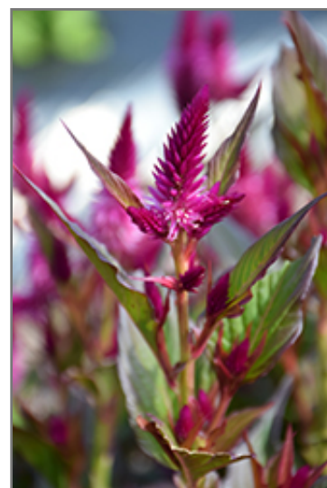
Kelos Atomic Violet Celosia flowers