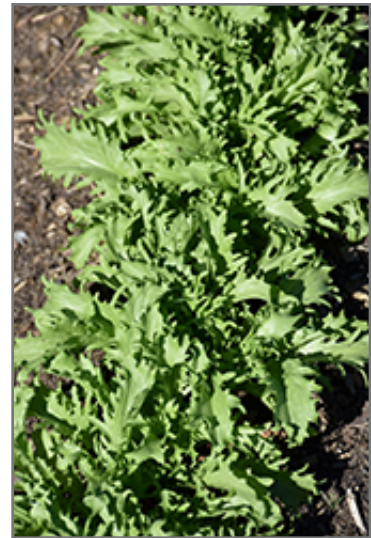
Rhodos Endive

This plant is typically grown in a designated herb garden. It does best in full sun to partial shade. It prefers to grow in average to moist conditions, and shouldn't be allowed to dry out. It is not particular as to soil pH, but grows best in rich soils. It is highly tolerant of urban pollution and will even thrive in inner city environments. This is a selected variety of a species not originally from North America.