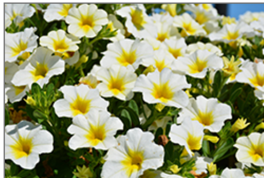
MiniFamous Neo White + Yellow Eye Calibrachoa flowers

MiniFamous Neo White + Yellow Eye Calibrachoa is a dense herbaceous annual with a trailing habit of growth, eventually spilling over the edges of hanging baskets and containers. Its medium texture blends into the garden, but can always be balanced by a couple of finer or coarser plants for an effective composition.