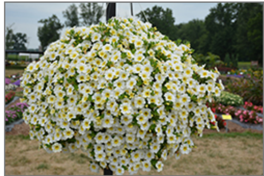
MiniFamous Neo White + Yellow Eye Calibrachoa in bloom