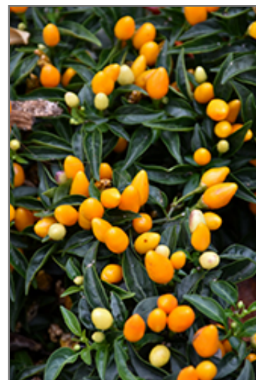
Sedona Sun Ornamental Pepper fruit