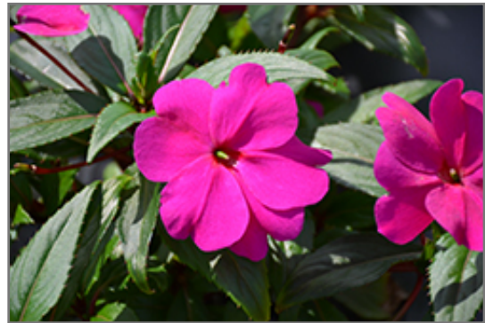
Divine Orchid New Guinea Impatiens flowers

Divine Orchid New Guinea Impatiens is recommended for the following landscape applications;