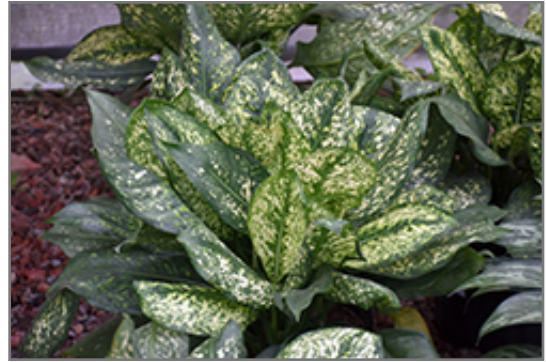
Lumina Chinese Evergreen

When grown indoors, Lumina Chinese Evergreen can be expected to grow to be about 3 feet tall at maturity, with a spread of 3 feet. It grows at a slow rate, and under ideal conditions can be expected to live for approximately 10 years. This houseplant performs well in both bright or indirect sunlight and strong artificial light, and can therefore be situated in almost any well-lit room or location. It does best in average to evenly moist soil, but will not tolerate standing water. The surface of the soil shouldn't be allowed to dry out completely, and so you should expect to water this plant once and possibly even twice each week. Be aware that your particular watering schedule may vary depending on its location in the room, the pot size, plant size and other conditions; if in doubt, ask one of our experts in the store for advice. It is not particular as to soil type or pH; an average potting soil should work just fine. Be warned that parts of this plant are known to be toxic to humans and animals, so special care should be exercised if growing it around children and pets.