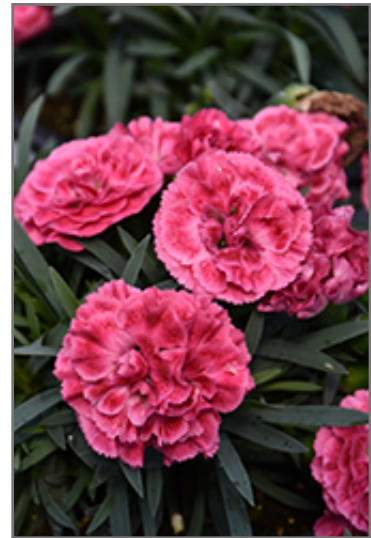
Fruit Punch Raspberry Ruffles Pinks flowers

This is a relatively low maintenance plant, and is best cleaned up in early spring before it resumes active growth for the season. It is a good choice for attracting bees and butterflies to your yard, but is not particularly attractive to deer who tend to leave it alone in favor of tastier treats. It has no significant negative characteristics.