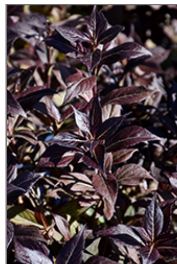
Date Night Stunner Weigela foliage