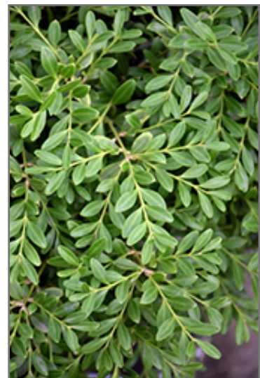
Green Borders Boxwood foliage