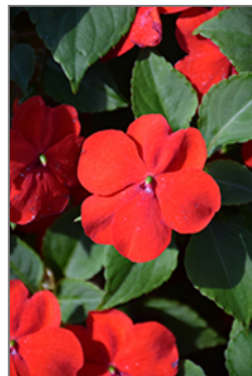
Beacon Bright Red Impatiens flowers

Beacon Bright Red Impatiens is recommended for the following landscape applications;