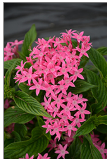
Lucky Star Pink Star Flower flowers

Lucky Star Pink Star Flower is recommended for the following landscape applications;