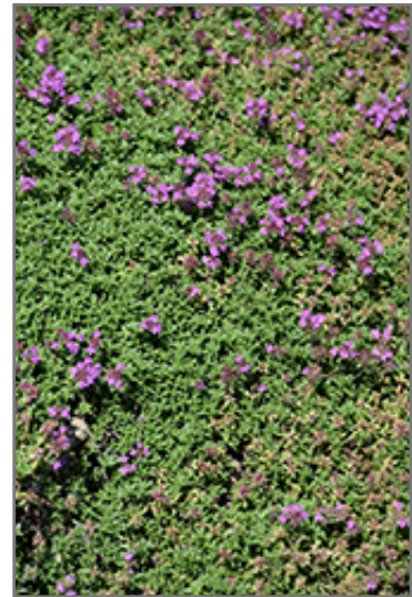
Creeping Thyme in bloom

Creeping Thyme is recommended for the following landscape applications;