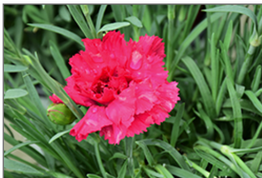
Fruit Punch Cranberry Cocktail Pinks flowers

Fruit Punch Cranberry Cocktail Pinks is recommended for the following landscape applications;