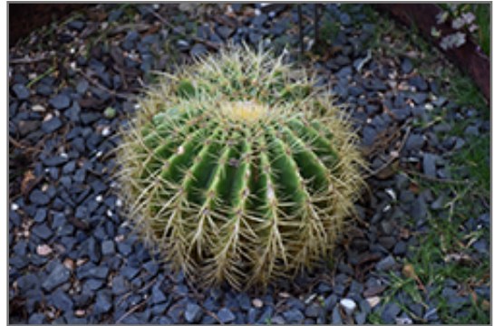
Golden Barrel Cactus

Golden Barrel Cactus is a succulent evergreen plant. It is a member of the cactus family, which are grown primarily for their characteristic shapes, their interesting features and textures, and their high tolerance for hot, dry growing environments. Like all cacti, it doesn't actually have leaves, but rather modified succulent stems that comprise the bulk of the plant, and which are designed to hold water for long periods of time. This particular cactus is valued for its distinctive barrel shape, and usually grows as a single spiny ribbed green stem. This plant has yellow cup-shaped flowers held atop the stems from late spring to early summer, which are interesting on close inspection.