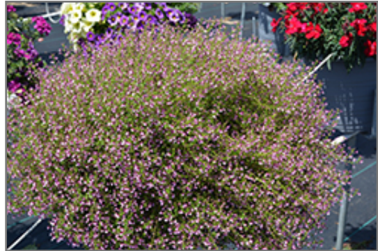
Pink Shimmer Cuphea in bloom

Pink Shimmer Cuphea will grow to be about 16 inches tall at maturity, with a spread of 16 inches. When grown in masses or used as a bedding plant, individual plants should be spaced approximately 12 inches apart. Its foliage tends to remain dense right to the ground, not requiring facer plants in front. Although it's not a true annual, this plant can be expected to behave as an annual in our climate if left outdoors over the winter, usually needing replacement the following year. As such, gardeners should take into consideration that it will perform differently than it would in its native habitat.