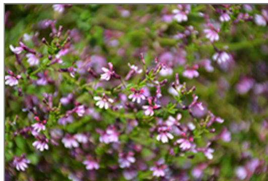
Pink Shimmer Cuphea flowers