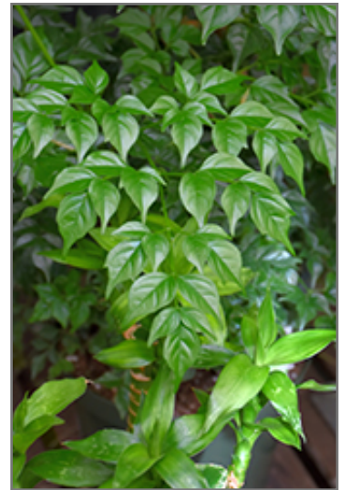
China Doll foliage

When grown indoors, China Doll can be expected to grow to be about 6 feet tall at maturity, with a spread of 4 feet. It grows at a medium rate, and under ideal conditions can be expected to live for approximately 40 years. This houseplant will do well in a location that gets either direct or indirect sunlight, although it will usually require a more brightly-lit environment than what artificial indoor lighting alone can provide. It does best in average to evenly moist soil, but will not tolerate standing water. The surface of the soil shouldn't be allowed to dry out completely, and so you should expect to water this plant once and possibly even twice each week. Be aware that your particular watering schedule may vary depending on its location in the room, the pot size, plant size and other conditions; if in doubt, ask one of our experts in the store for advice. It is not particular as to soil type or pH; an average potting soil should work just fine.