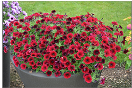
Supertunia Black Cherry Petunia in bloom