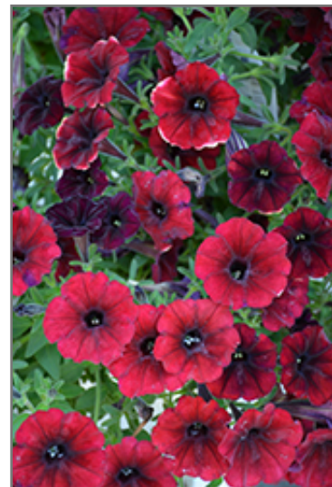
Supertunia Black Cherry Petunia flowers

Supertunia Black Cherry Petunia is a dense herbaceous annual with a trailing habit of growth, eventually spilling over the edges of hanging baskets and containers. Its medium texture blends into the garden, but can always be balanced by a couple of finer or coarser plants for an effective composition.