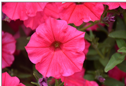
Supertunia Vista Paradise Petunia flowers

Supertunia Vista Paradise Petunia is recommended for the following landscape applications;