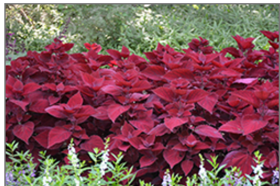
Beale Street Coleus