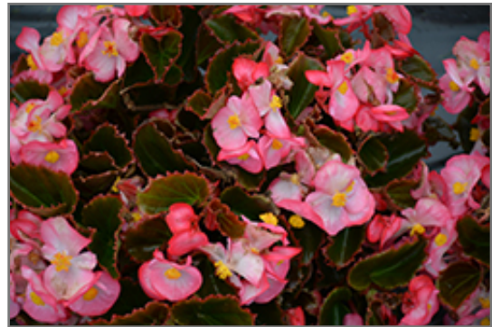
Senator IQ Rose Bicolor flowers