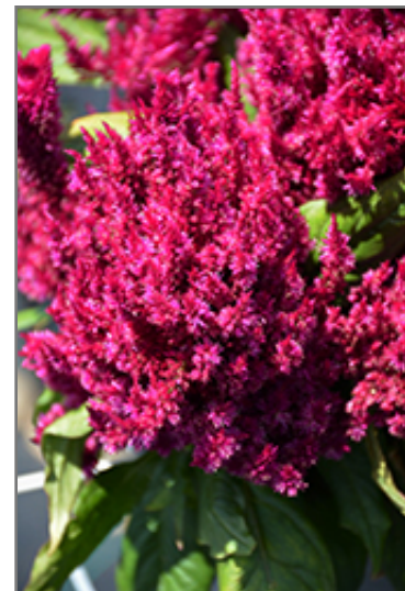
First Flame Purple Celosia flowers

First Flame Purple Celosia is recommended for the following landscape applications;