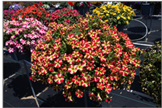
Amore Queen of Hearts Petunia in bloom

Amore Queen of Hearts Petunia will grow to be about 12 inches tall at maturity, with a spread of 14 inches. When grown in masses or used as a bedding plant, individual plants should be spaced approximately 10 inches apart. Its foliage tends to remain dense right to the ground, not requiring facer plants in front. This fast-growing annual will normally live for one full growing season, needing replacement the following year.