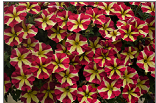
Amore Queen of Hearts Petunia flowers