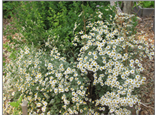
German Chamomile

German Chamomile will grow to be about 24 inches tall at maturity, with a spread of 18 inches. It grows at a fast rate, and under ideal conditions can be expected to live for approximately 5 years. As an herbaceous perennial, this plant will usually die back to the crown each winter, and will regrow from the base each spring. Be careful not to disturb the crown in late winter when it may not be readily seen!