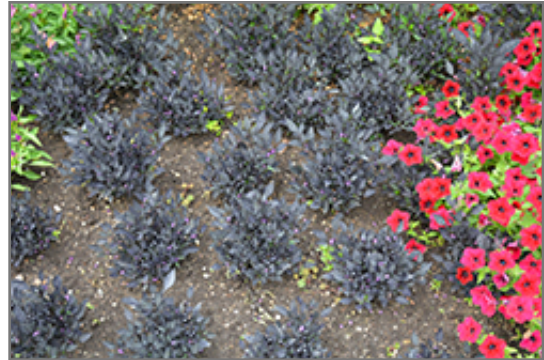
Onyx Red Ornamental Pepper

This plant will require occasional maintenance and upkeep, and should not require much pruning, except when necessary, such as to remove dieback. It is a good choice for attracting bees and butterflies to your yard, but is not particularly attractive to deer who tend to leave it alone in favor of tastier treats. It has no significant negative characteristics.