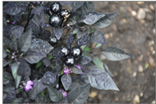
Onyx Red Ornamental Pepper fruit