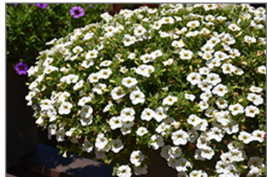
Cabaret Bright White Calibrachoa flowers