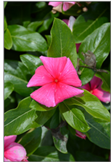
Cora XDR Deep Strawberry flowers

Cora XDR Deep Strawberry is recommended for the following landscape applications;