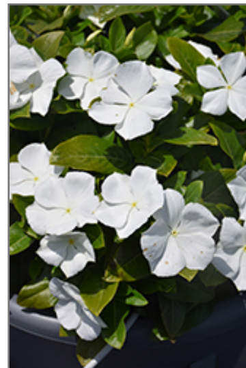
Cora XDR White flowers

Cora XDR White is recommended for the following landscape applications;