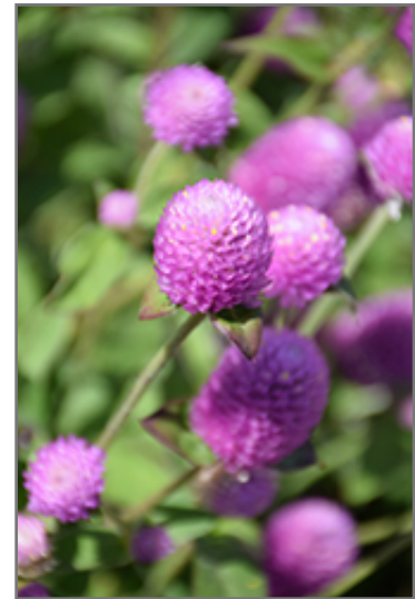
Ping Pong Lavender Globe Amaranth flowers

Ping Pong Lavender Globe Amaranth is recommended for the following landscape applications;