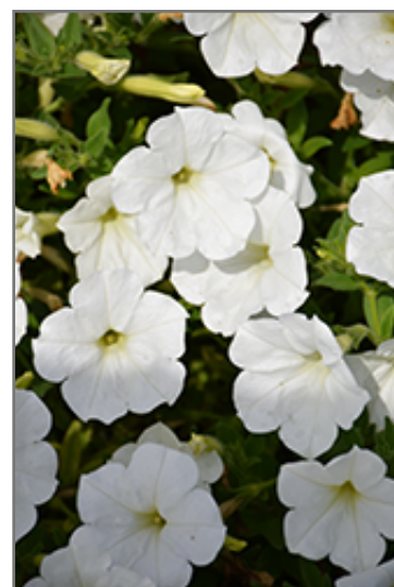
ColorRush White Petunia flowers