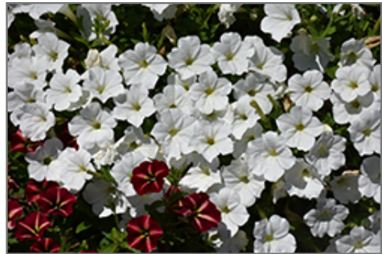
ColorRush White Petunia flowers

ColorRush White Petunia is recommended for the following landscape applications;