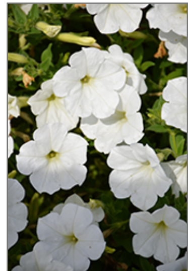
ColorRush White Petunia flowers