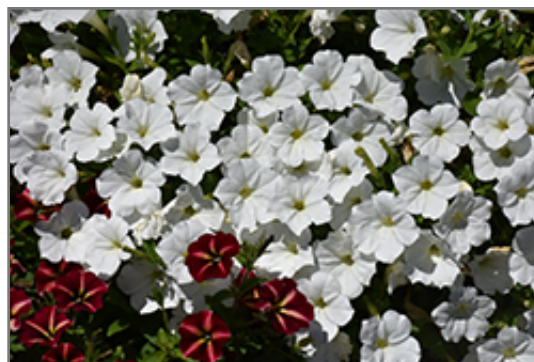
ColorRush White Petunia flowers

ColorRush White Petunia is recommended for the following landscape applications;