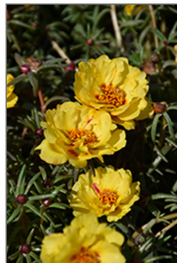
Happy Hour Banana Portulaca flowers

Happy Hour Banana Portulaca is recommended for the following landscape applications;