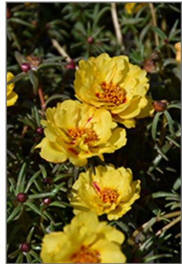
Happy Hour Banana Portulaca flowers

Happy Hour Banana Portulaca is recommended for the following landscape applications;