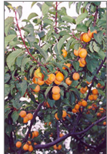
Apricot fruit