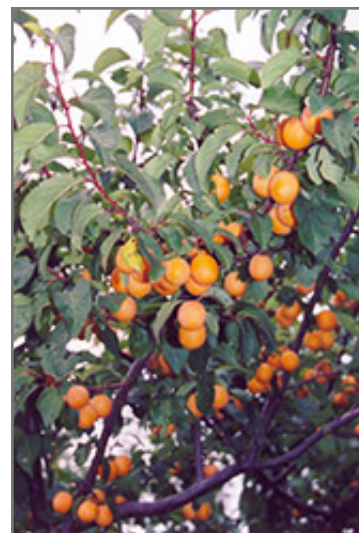
Apricot fruit