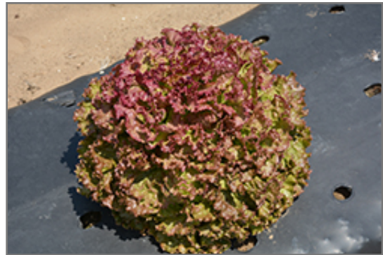
New Red Fire Lettuce

This plant is typically grown in a designated vegetable garden. It does best in full sun to partial shade. It does best in average conditions that are neither too wet nor too dry, and is very intolerant of standing water. It is not particular as to soil pH, but grows best in rich soils. It is quite intolerant of urban pollution, therefore inner city or urban streetside plantings are best avoided. This is a selected variety of a species not originally from North America.; however, as a cultivated variety, be aware that it may be subject to certain restrictions or prohibitions on propagation.