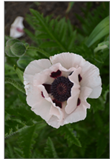
Royal Wedding Poppy flowers