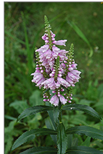
Obedient Plant flowers