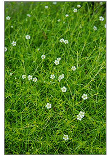
Scotch Moss flowers